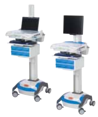
Final sku set | Step 1 + Step 2

○ Choose a drawer sku for the XP from the options to the right