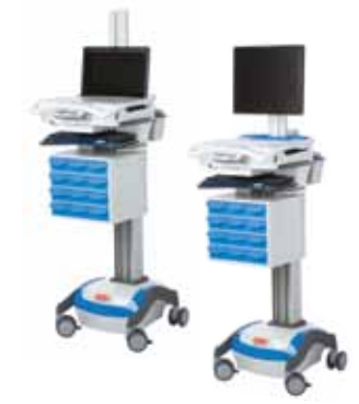
Final sku set | Step 1 + Step 2 + Step 3

○ Choose a drawer sku for bottom 2 levels of the RX