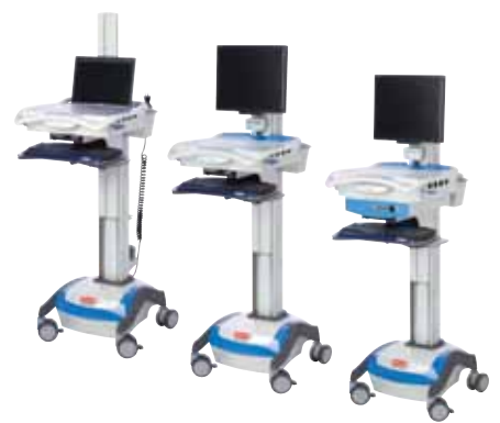
Final sku set | Step 1