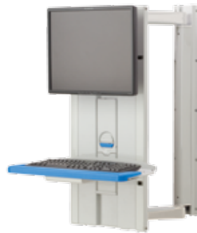
Standard Tandem Arm™