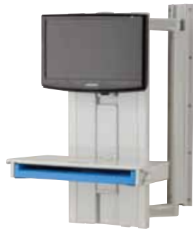
Premium Tandem Arm™