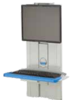
Standard Slim Line