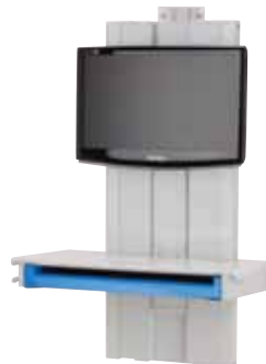
Premium Slim Line