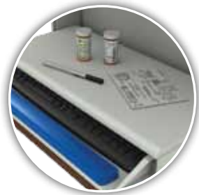
generous work surface