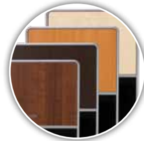
superior finish selection