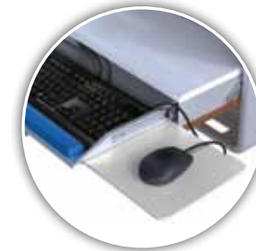
extra large mouse pads