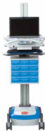
Self-Powered Device Medication Cart