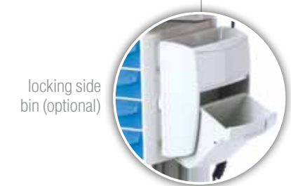
locking side bin (optional)