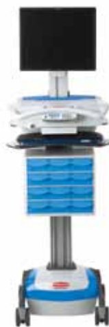
Powered Medication Cart