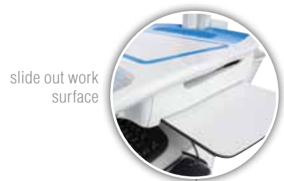
slide out work surface