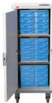
Transfer and Exchange Carts