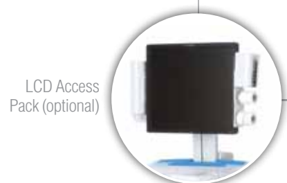
LCD Access Pack (optional)